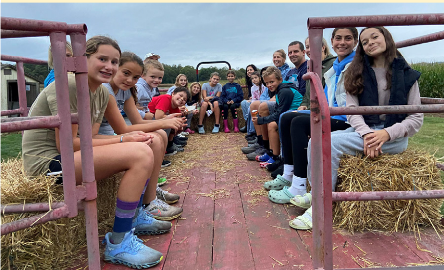
A great time was had by all who attended the Snyder's Corn Maze Activity!