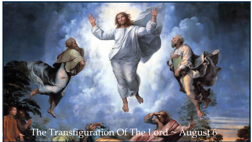
The Transfiguration Of The Lord ~ August 6